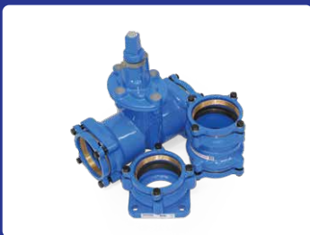
PE DI FITTINGS