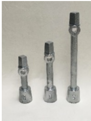
FIGURE 1 DAEMCO VALVE EXTENSION SPINDLES

Each spindle extension is fitted with a M10 Grade 316 stainless steel grub screw to allow for retention to the spindle cap.