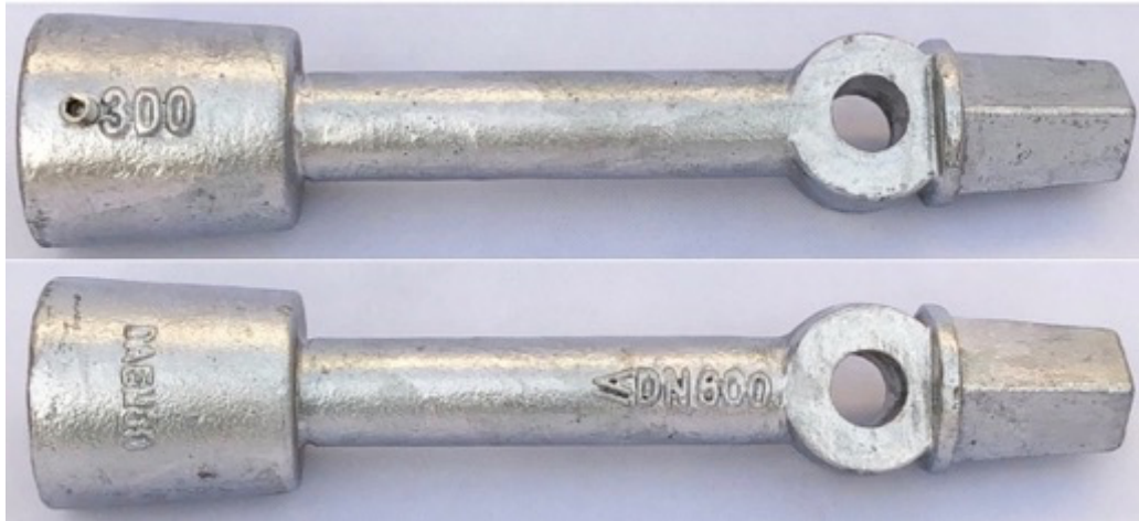
FIGURE 2 PRODUCT MARKING